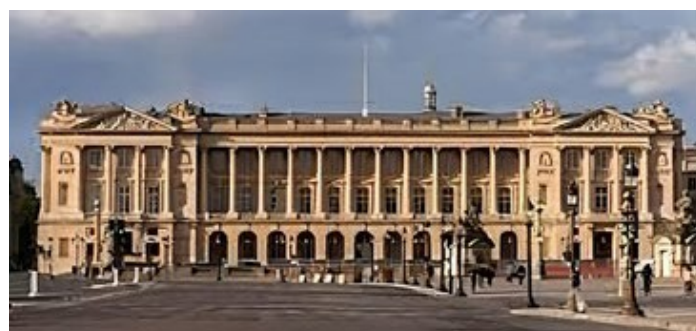
Hôtel de la Marine